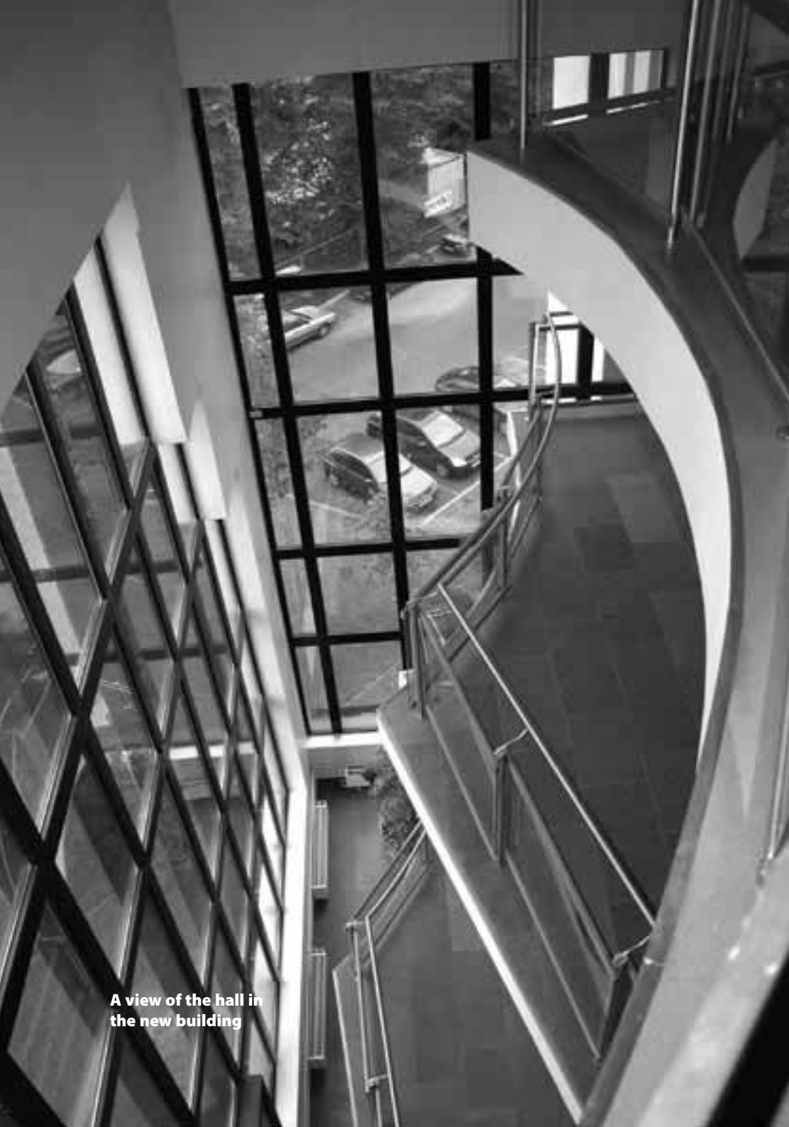
A view of the hall in the new building