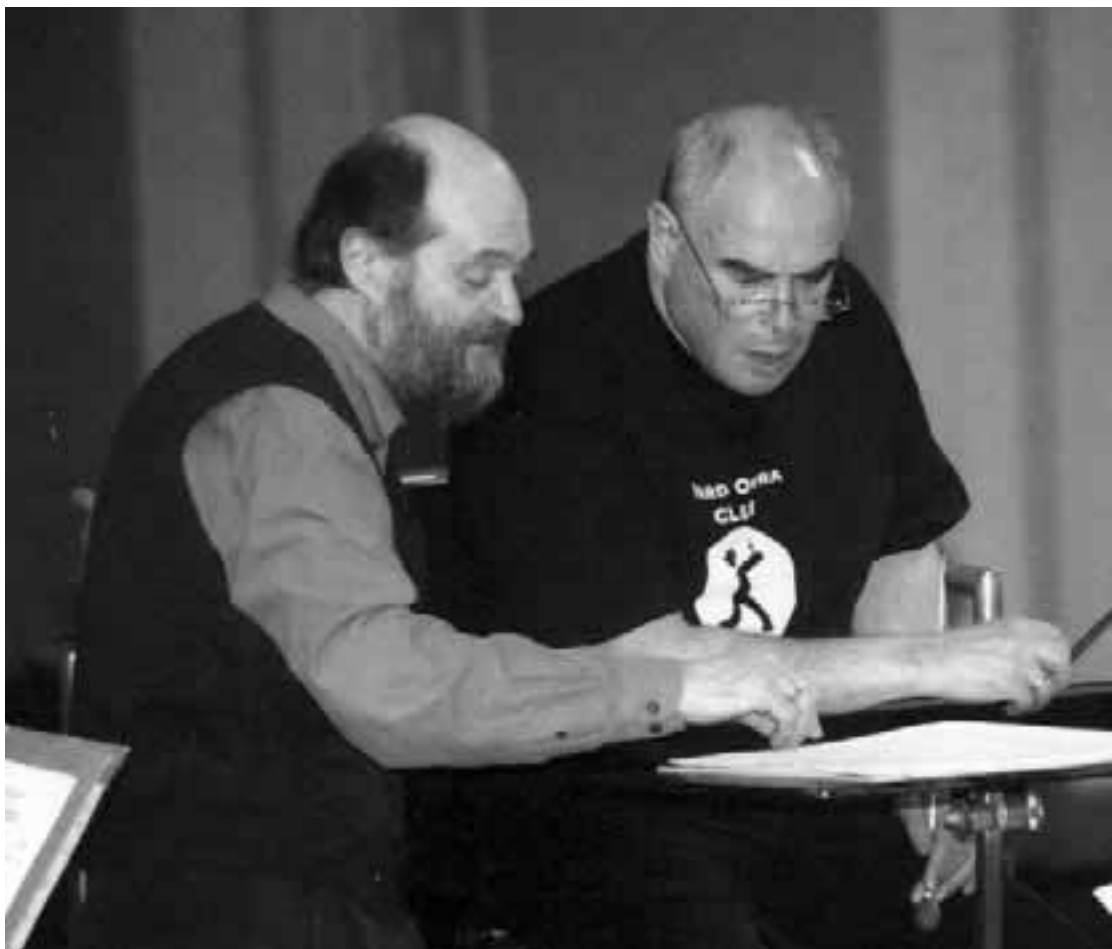
Arvo Pärt and Eri Klas at the rehearsal of composer's monographic concert